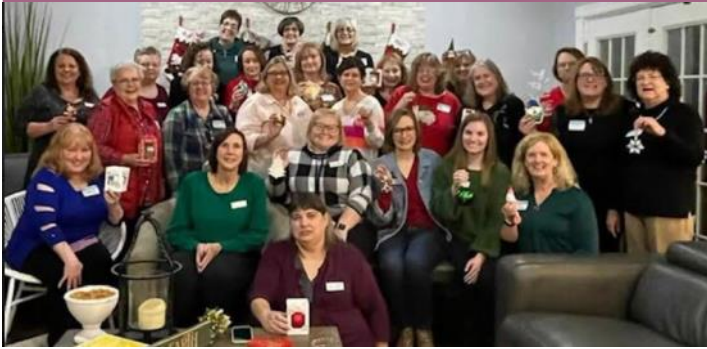
Kappa Delta | Christmas Party