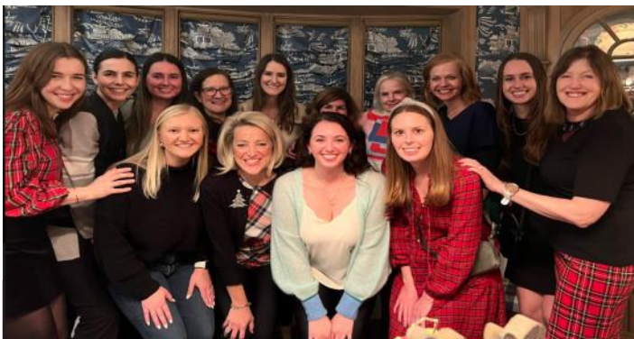
Kappa Alpha Theta | Christmas Party