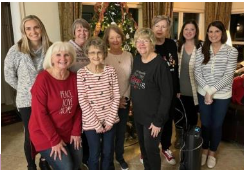
Alpha Sigma Alpha | Dirty Santa Gift Exchange