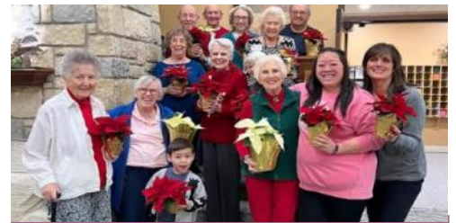
Gamma Phi Beta | Donating poinsettias to Trinity Woods