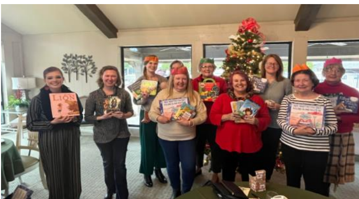
Phi Mu | Christmas Party and Book Drive to benefit St. Francis Children's Hospital