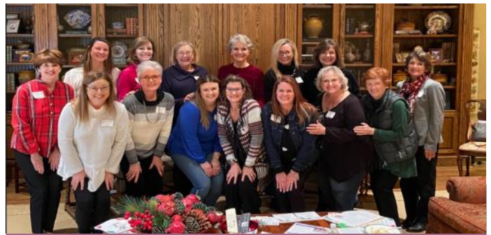
Pi Beta Phi | Christmas Party