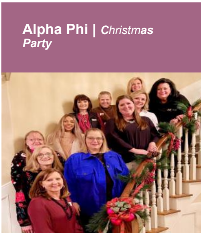
Alpha Phi | Christmas Party