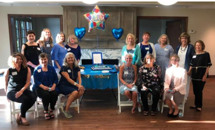
Kappa Delta | 100th Anniversary Celebration of the Tulsa Alumnae Association of Kappa Kappa Gamma