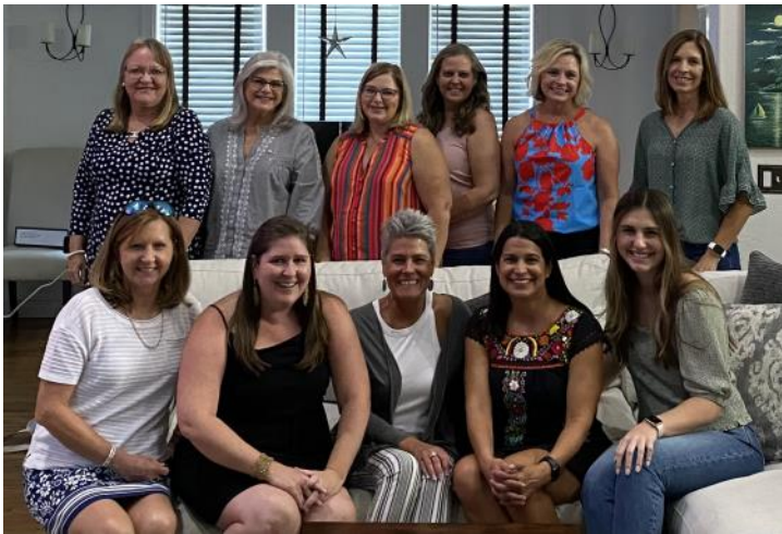
Alpha Phi Delta | Open House