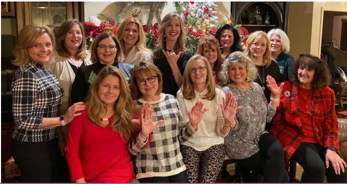
Alpha Phi | Annual Christmas Party