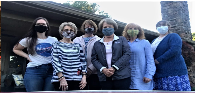
Alpha Sigma Alpha | Spring Social