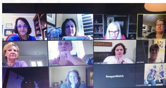
Gamma Phi Beta | Virtual Book Club