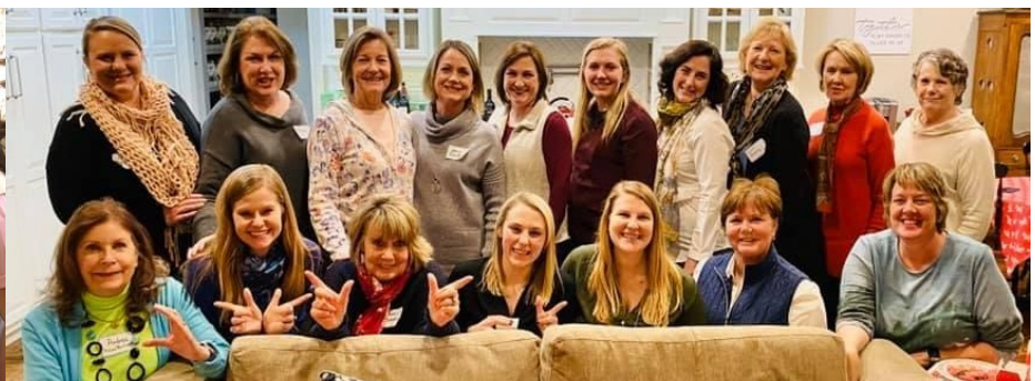
Gamma Phi Beta | Left: Donating poinsettias to the Methodist Manor Nursing Home; Right: Celebrating sisterhood with bunco night