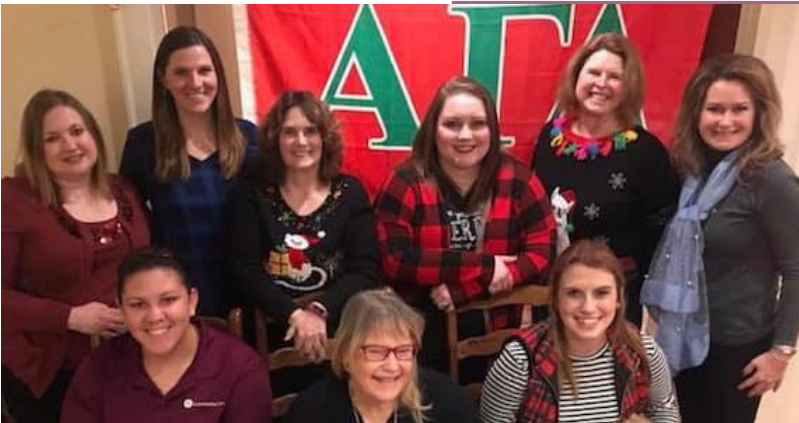
Alpha Gamma Delta | Holiday Party