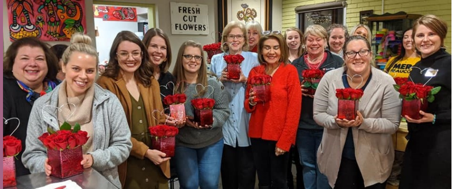
Delta Zeta | Flower Design Class